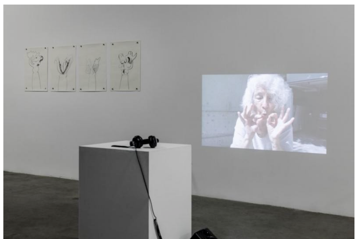
Song of the Vowels, 2012, and Detail View of Drawings

NG: You have said that coincidence may be considered "harmonic tones of occurence" and as "twilight guideposts." How does coincidence feed into your practice of drawing?