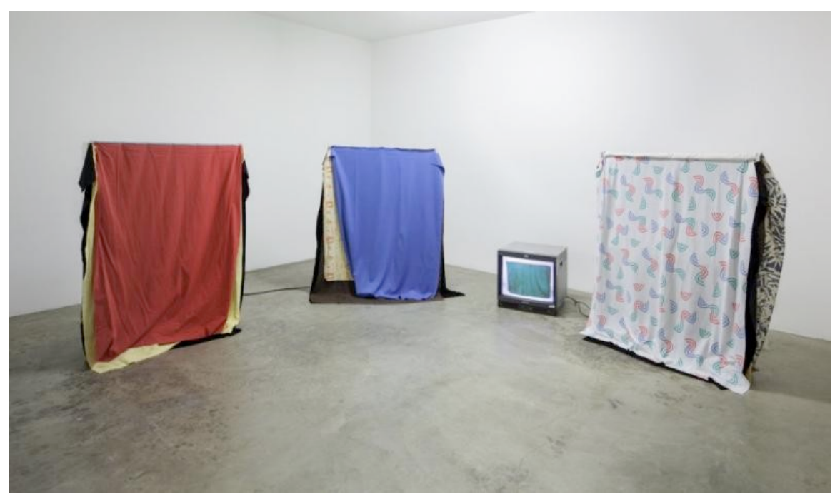
Cloths, 1967, Installation View with Video piece by Hollis Frampton, Courtesy of The Box Gallery and the artist, Photo: Fredrik Nilsen

NG: What are your thoughts on suspension? Could whistling also be considered a suspended form?